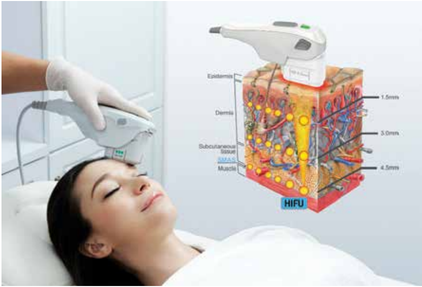
Traditional HIFU Handpiece: 1 Line